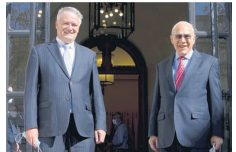
New Secretary-General of the Organisation for Economic Cooperation and Development (OECD) Mathias Cormann, of Australia, left, and outgoing secretary general Angel Gurría pose during the handover ceremony at the OECD headquarters in Paris, Tuesday, June 1 2021.

"I think that we are in a much better position than we were towards the end of last year," he said. "I'm quietly optimistic that with the level of goodwill that